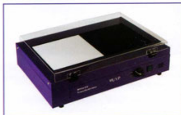
White/UV Transilluminator Easily switch between the UV and white light sources.