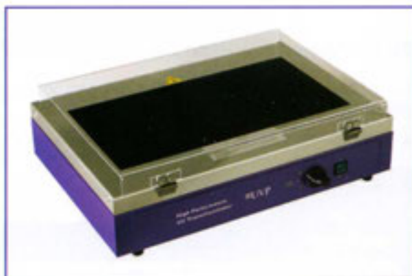
TFM-40V High Performance UV Transilluminator with variable intensity and 20x40cm filter. The hinged UV blocking cover is adjustable to different angles for access to the filter surface.