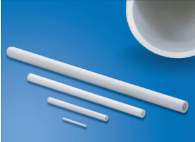
CeramTec manufactures tubes with a diameter range of 0.5 mm through to 300 mm and a standard maximum length of 2200 mm (greater upon request).

Mostly drawn in use to a specific requirement our manufactured protection tubes and insulators are primarily used within the industry of temperature measurement and control technology. CeramTec manufactures ceramic tubes for a wide range of applications. Technical ceramics manufactured by us meet the most stringent specifications and high accuracy standards.