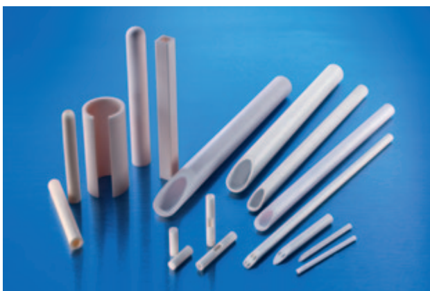
Standard Pyrometric Tubes, Insulating Rods and Tubes