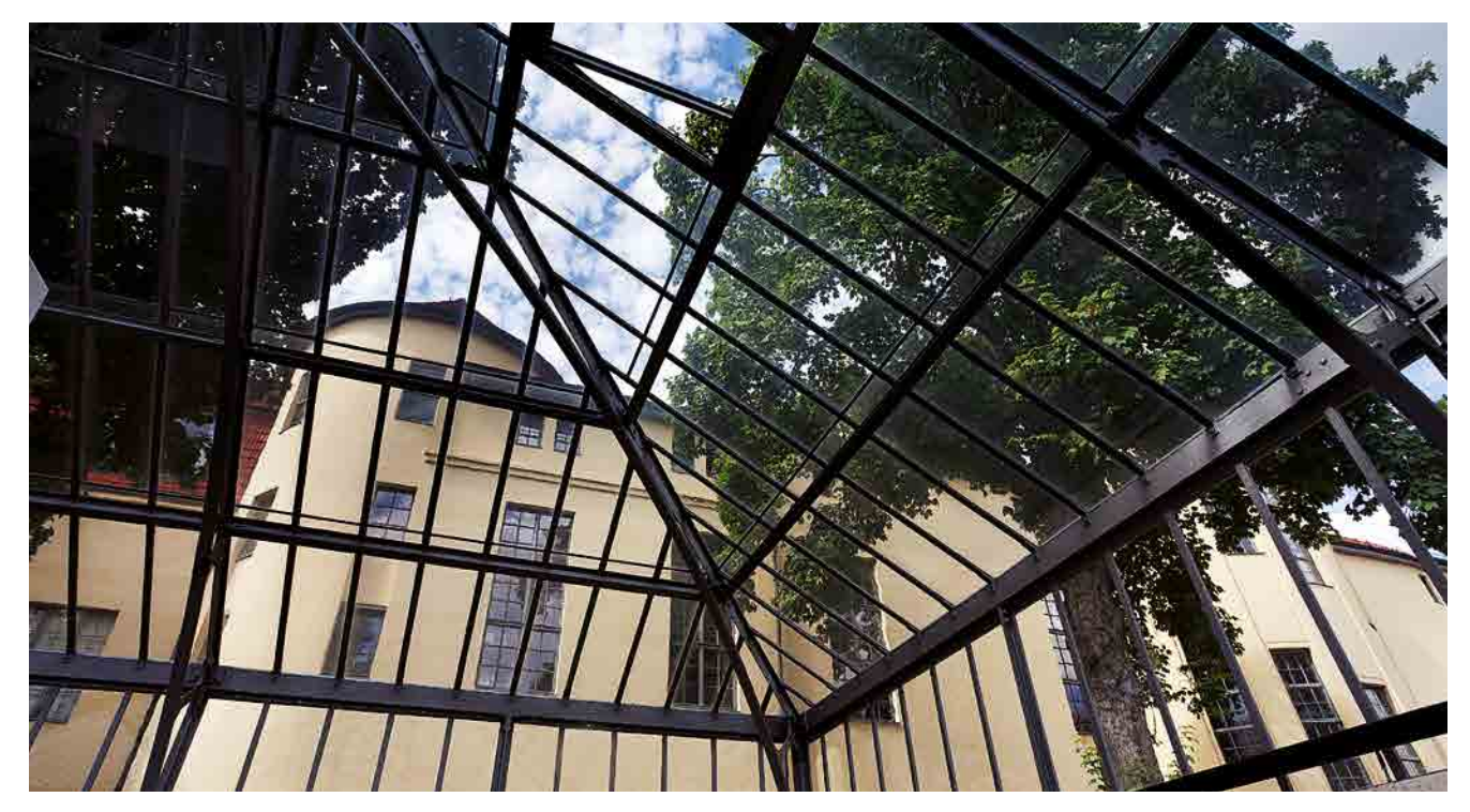
Bauhaus-University Weimar - Brendelsches Atelier